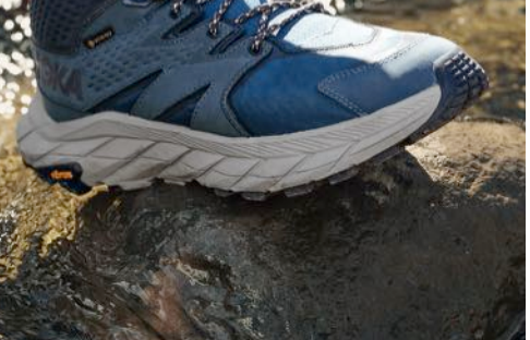
ABOVE: No muck or yuck. A gusseted tongue helps keep out trail debris and splashing water so feet stay comfortable.

A. WOMEN'S PERFORMANCE UTILITY TANK The relaxed fit, gathered waist, ready-to-work tank. Breathable and fast-drying thanks to Polartec® Power Dry® fabric, this lightweight go-to is a true performer. Shown in Rosette. Also available in White. #1117001 | $42