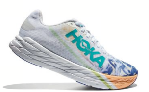
ROCKET X $180