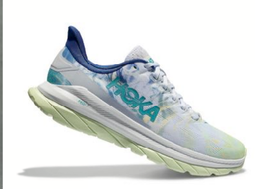
MACH 4 $130