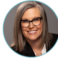
Governor Katie Hobbs Governor State of Arizona