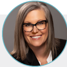
Governor Katie Hobbs Governor State of Arizona